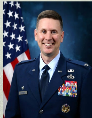
Col Brian Hartless 10th Air Base Wing Commander