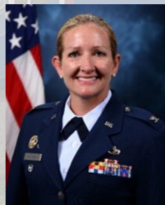
Col Brooke Rinehart 10th Air Base Wing Vice Commander